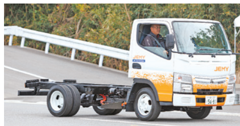
Pre-owned truck converted to EV

In the first initiative of its kind in Japan, SBS Holdings is working to convert small diesel trucks into EVs, with a view to mass-producing the vehicles in the future. The Company is already partnering with IAT Co., Ltd. and YAMATO Mobility & Mfg. Co., Ltd. to convert 2 t Isuzu Elf and 1.5 t Mitsubishi Fuso Canter small diesel trucks, which had been headed to the scrapyard, to EVs, with performance and safety tests underway on demonstration tracks. The converted vehicles demonstrate similar range to new-built EV trucks, and can be returned to duty as delivery vehicles quickly and at low cost.