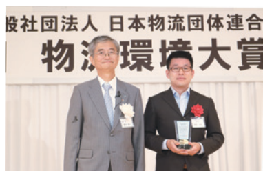
Accepting the Special Prize at the 25th Logistics Environment Awards

The year under review was a banner year for SBS Toshiba Logistics Co., Ltd. for recognition of its improvement success stories. In May 2024, SBS Toshiba Logistics earned Platinum certification under the "System for Recognition of Excellence in Improvement of Logistical Workplaces," organized by the Japan Institute of Logistics Systems. The award was bestowed on SBS Toshiba Logistics at Japan Logistics Improvement Success Story Convention 2024. Moreover, in June 2024, the same company was selected for the Excellence in Logistical Improvement Award, which is conferred on companies whose outstanding success stories were lauded at the aforementioned Convention. SBS Toshiba Logistics also won the Special Prize at the 25th Logistics Environment Awards, sponsored by the Japan Association for Logistics and Transport. Finally, in August 2024 the company shone at the Japan Packaging Contest 2024, winning the Industrial Packaging Award, picking up an award at the contest for the 22nd year running.